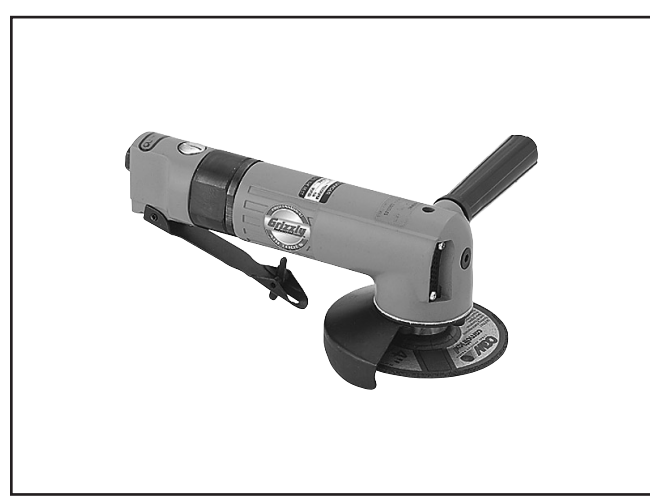
Figure 1. Model G5786.

Make sure grinding wheel is backed by flange and tightened securely with the flange nut.